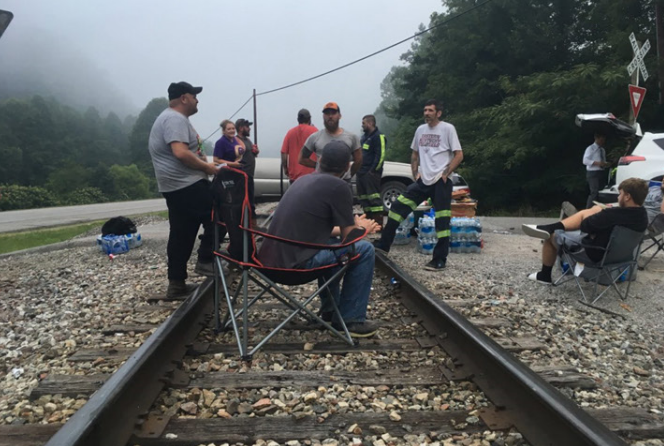
Figure 1. Underground mine workers in 1908; coal miners protesting for fair pay in 2020