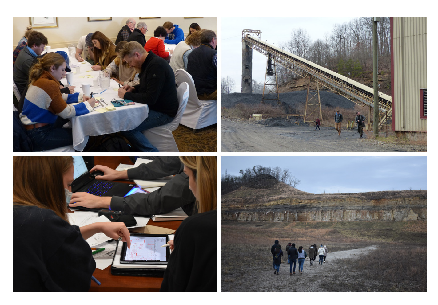
Figure 3. Community-based design charrettes with students and local leaders; site visits to abandoned mines