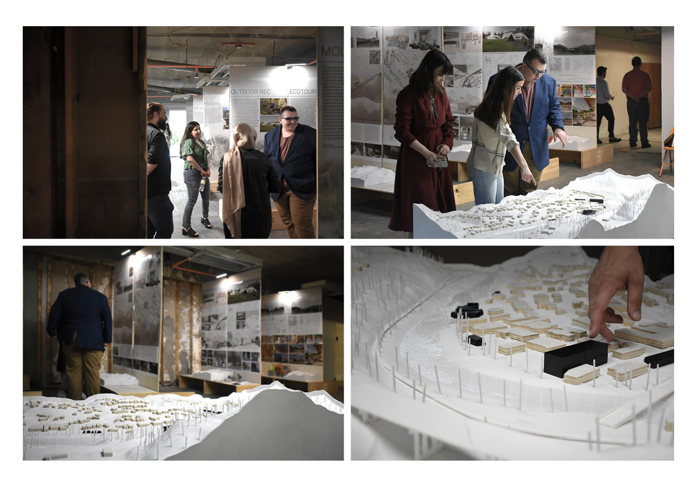
Figure 5. Public exhibition of faculty research and student design projects

are more likely in the coming climate era, Appalachian communities, particularly post-mining communities facing acute socio-economic and demographic shifts, will continue to suffer flooding impacts they can ill afford.<sup>17</sup> Recognizing that flooding will continue—and likely increase in the coming years—the research and design of Studio Appalachia examined a range of possibilities for designing a more resilient future.<sup>18</sup>